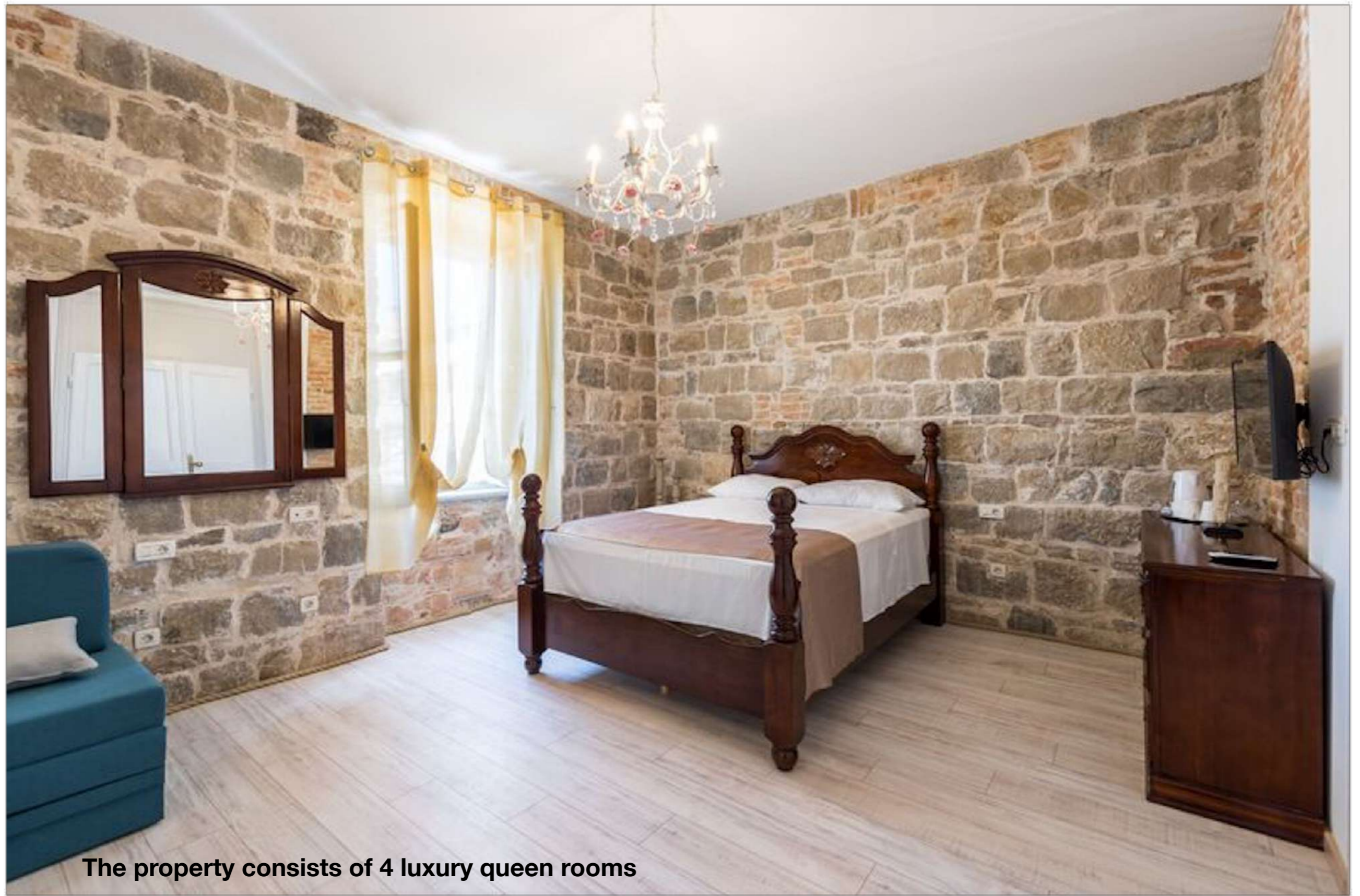
The property consists of 4 luxury queen rooms

Discover the elegance and exclusivity of our rooms, where historical heritage meets modern elegance. Luxury rooms which meet the highest standards in terms of features and design